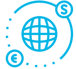
TRADE & LOGISTICS